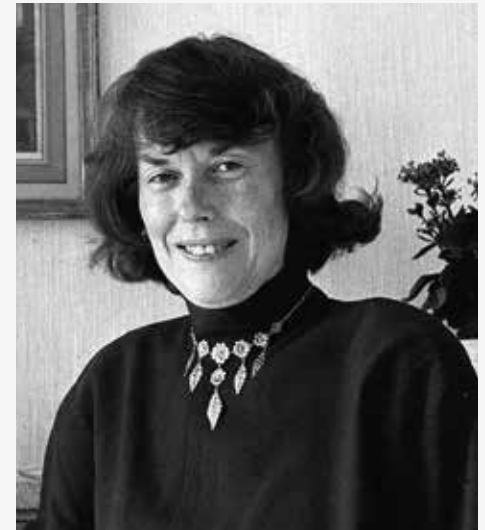
«Tireless»: Faith Whittlesey, 1985 in Geneva.

«The death of Faith Whittlesey made me very sad. I will remember her as a great friend of Switzerland, who remained steadfast in our country even when Switzerland was criticized in the Uni-