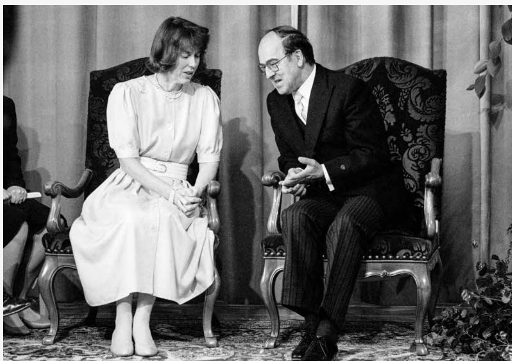
«Stroke of luck»: with swiss federal councillor Furgler, 1985.

«The death of Faith Whittlesey made me very sad. I will remember her as a great friend of Switzerland, who remained steadfast in our country even when Switzerland was criticized in the United Sta-